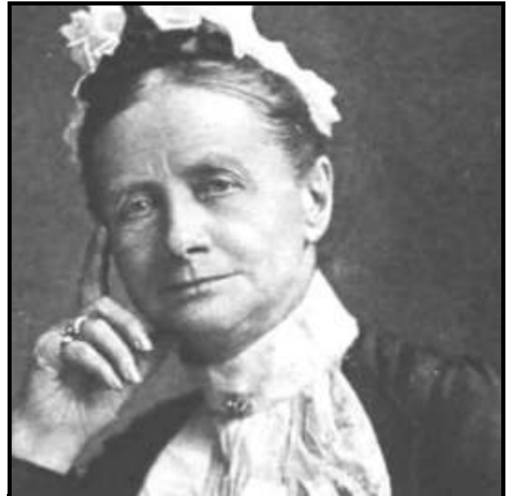
Mrs Cecil Frances Alexander

Rather direct and stark for today's taste, but then, when she wrote it there were few young children who did not know someone - parent, sibling or friend - who had died, and the hymn does end with the reminder: 'And Christians only fall asleep to wake again in Heav'n'.