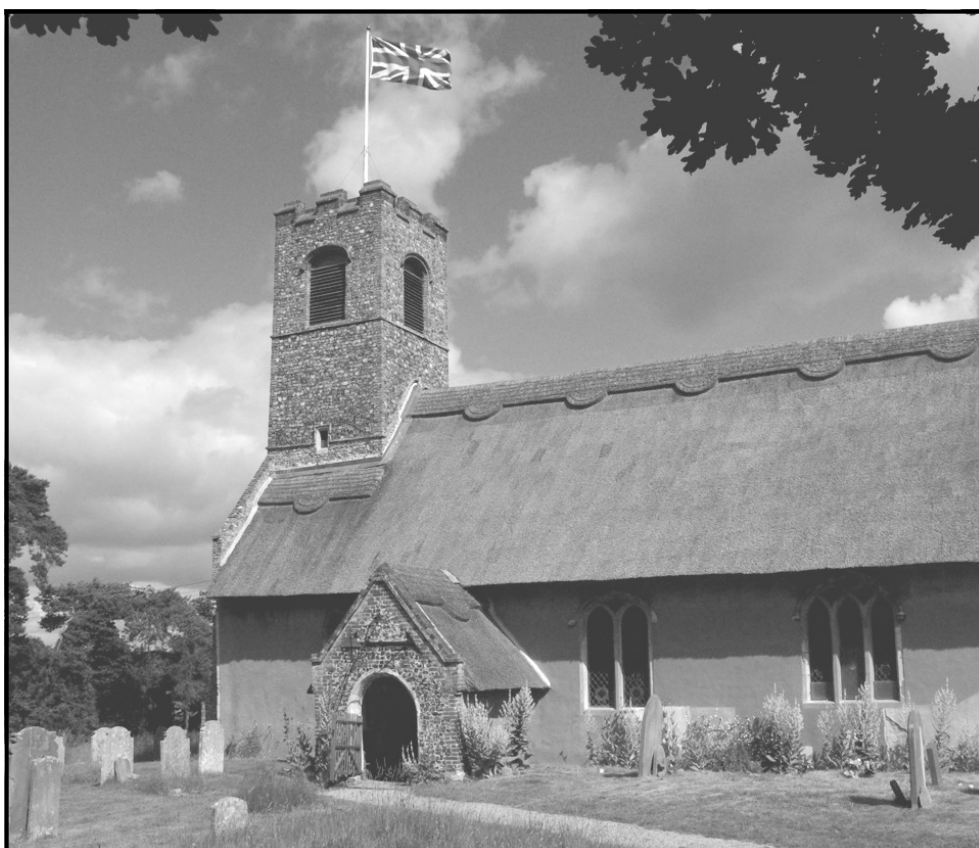
Thurton Church