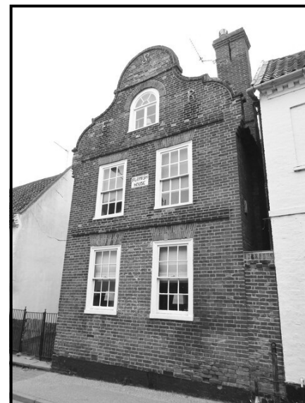
Flemish House, Beccles

Governments were instrumental in supporting the wool trade by laws, such as that of the Act of 1571, which said " ... all male commoners over 6 years old to wear to church on Sundays" ... "a cap of wool, thicked and dressed in England, made within this realm and only dressed and finished by some of the trade of cappers, upon pain to forfeit, for every day of not wearing 3s 4d"