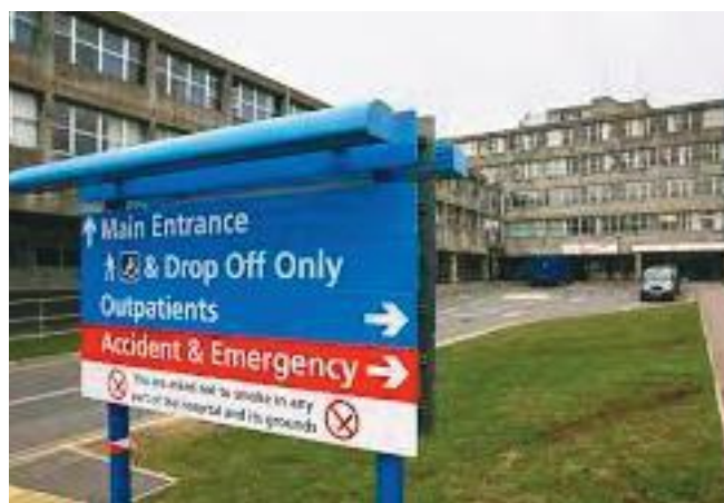
Northwick Park Hospital

An NHS spokesperson said: “Incidents like these are extremely rare, however when they do happen, the NHS is committed to learning from them to improve care for future patients.”