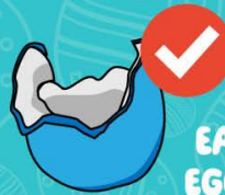
EASTER EGG FOIL